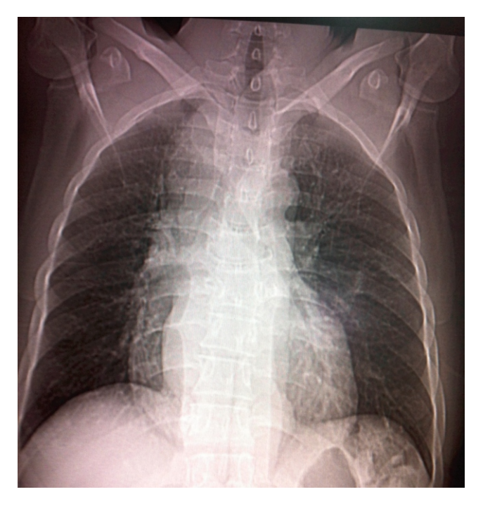
Fig 1:Plain chest radiograph (frontal projection) showing widened mediastinum with mass lesion in the right hemithorax with mottled opacities.

The patient had heller's operation and Dor's fundoplication. He did well and was subsequently discharged home after 12 days post surgery.