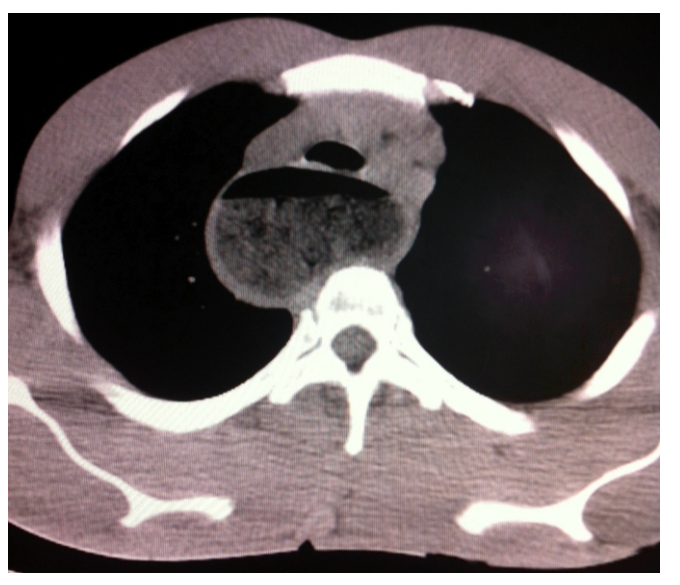
Fig 3: Axial computed tomography of the chest on mediastinal window showing grossly dilated oesophagus with air-food particles levels.