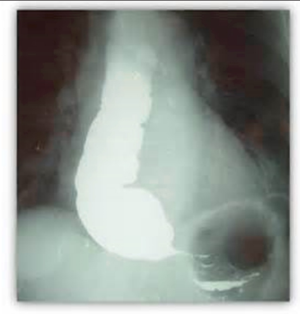
Fig 2: Barium swallow examination showing a dilated contrast filled oesophagus with a narrowed lower end.